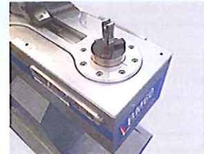
Adaptation to accept other manufacturer's tools